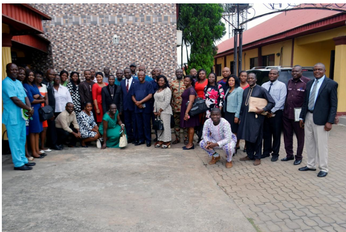
Figure 1. Group photograph of participants

During the quarter in review, too, specifically on 22nd November 2018, the 10th APRNet Seminar was held at De Regent Hotels LTD. The Policy Seminar which was supported by International Food Policy Research Institute (IFPRI-Nigeria) was attended by 48 participants from the academia, research community, Ministries and Development Agencies (MDAs), private agribusiness firms, NGOs, farmer associations, Postgraduate students in Agricultural sciences and related agricultural and food policy fields. Some distinguished guests included - the Honourable Commissioner for Agriculture, Environment and Natural Resources Imo State,