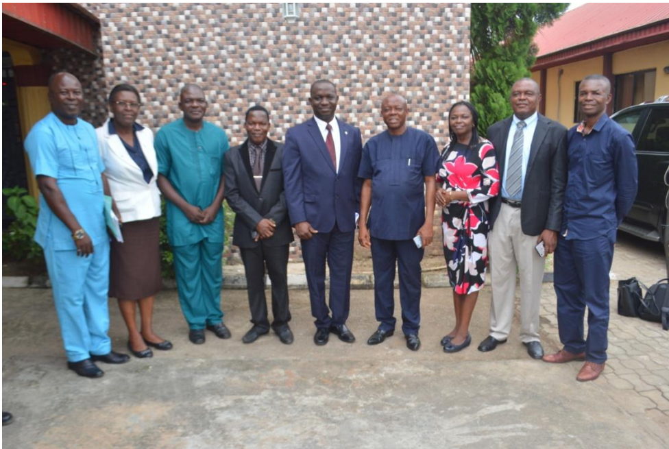
APRNet EXCO with the Imo State Commissioner for Agriculture and Environment and the Vice Chancellor of Federal University of Technology, Owerri (represented by his Deputy VC Admin.)